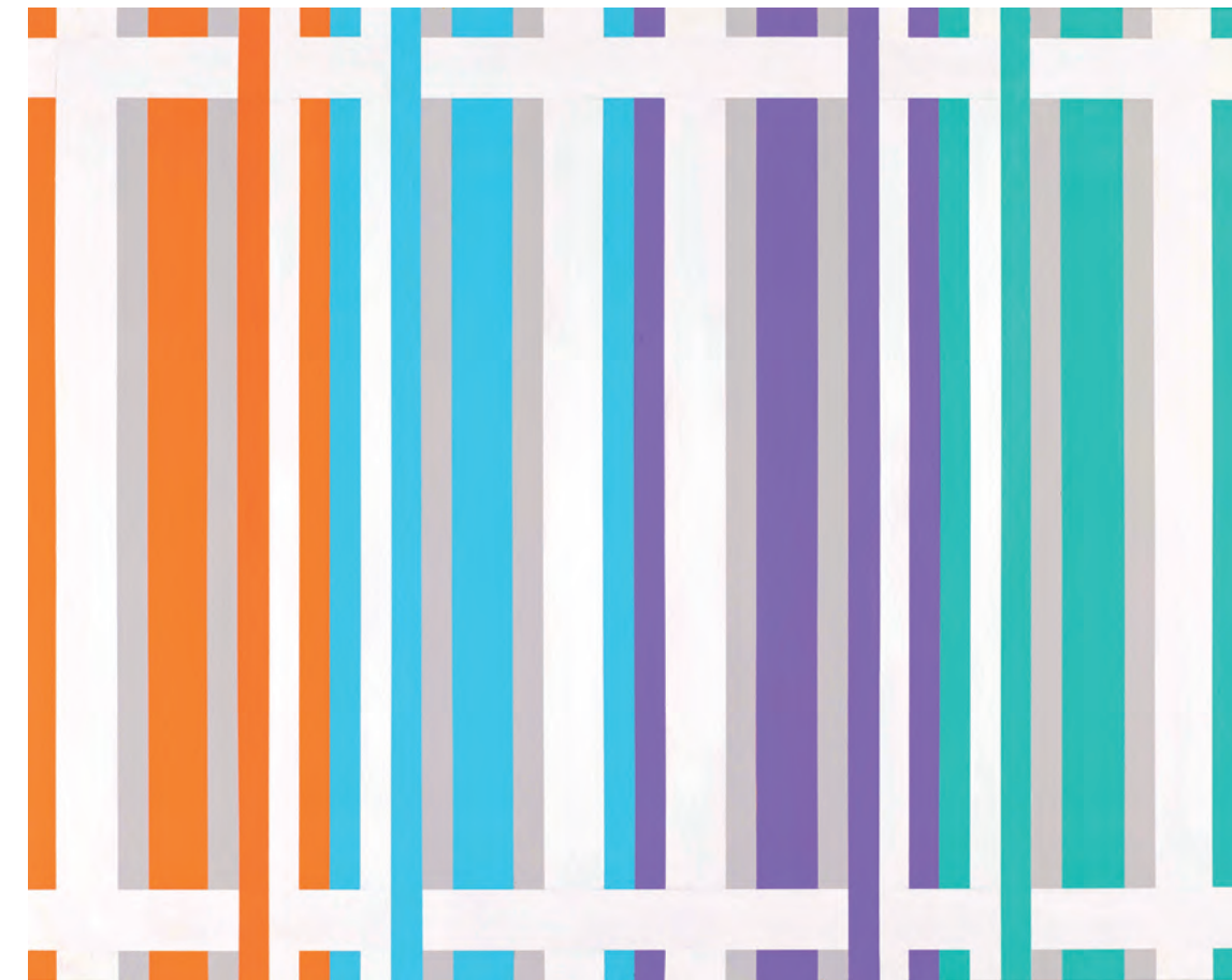
View from the Prendergast's House. Chambésy, Geneva, 2013. Acrylic on Linen, 80 x 100 cm