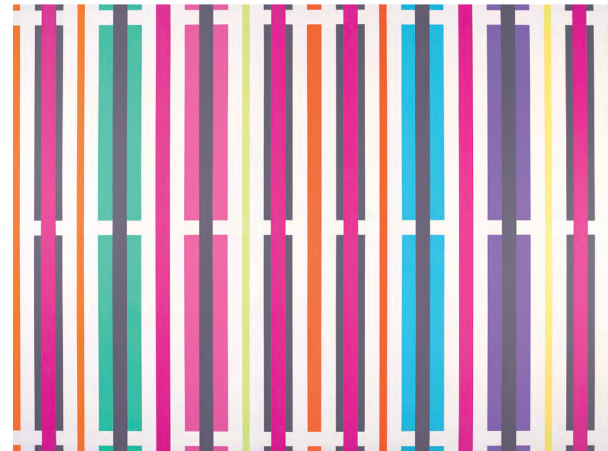
Mid-Day, Rue de l'Hôtel-de-Ville, Geneva, 2013. Acrylic on Linen, 130 x 175 cm